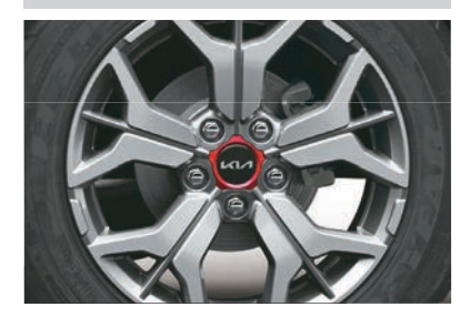
Let you stay in control in case of