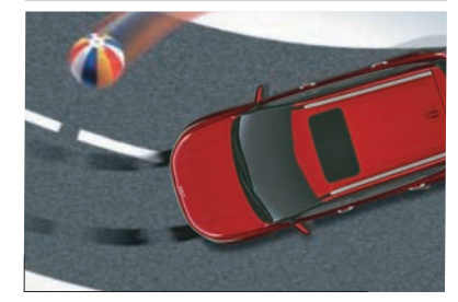
Enhanced safety features allow you to stay in complete control