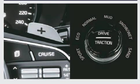
Help with quick gear shifts at the touch of a finger and makes the drive more thrilling on different terrains