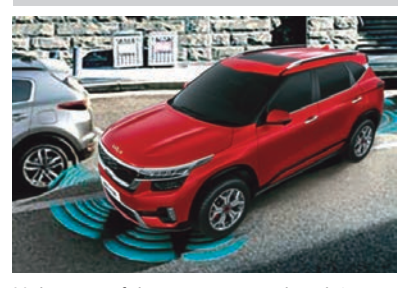
Help you safely maneuver and park in peculiar Indian conditions