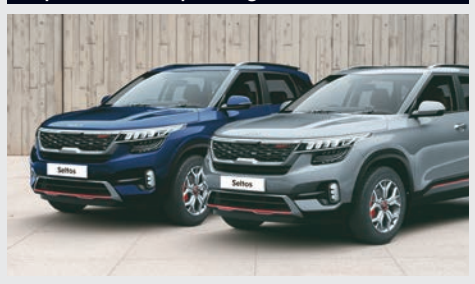
Allows you to announce your arrival as the colors complement your badass personality