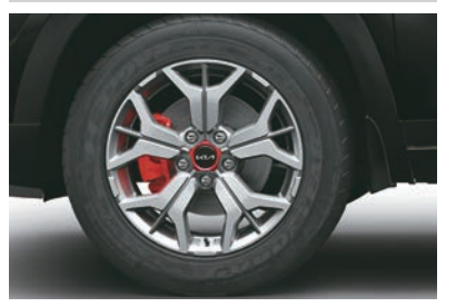
An absolute showstopper. One glance, and you'll know why