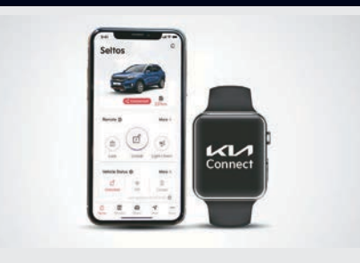
Elevates your connected car experience in an inspiring way with 58 smart features