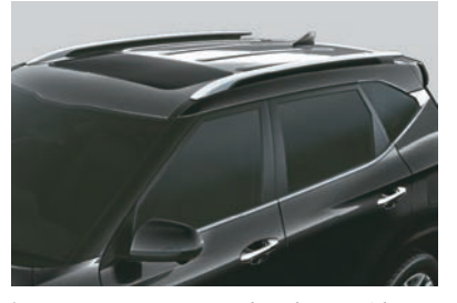
Lets you stay connected to the outside world